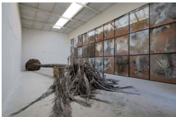
Anselm Kiefer (02.10.20-21.03.21) Anselm Kiefer (October 2 – March 21, 2021)

Anselm Kiefer, Palmsonntag, 2007, Sammlung Grothe in der Kunsthalle Mannheim