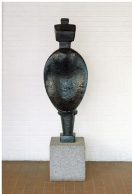
Mutter! (16.04. -15.08.21) Mother! (April 16 – August 15, 2021)

Alberto Giacometti, Femme- cuillère, 1926/1927, Louisiana Museum of Modern Art