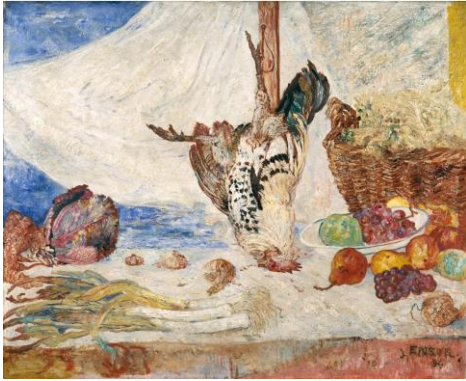
James Ensor (4.3. -5.7.2021) James Ensor (March 4 – July 5, 2021) James Ensor, Der tote Hahn, 1894