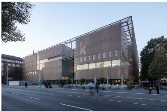
Außenansicht Kunsthalle Mannheim Exterior view Kunsthalle Mannheim